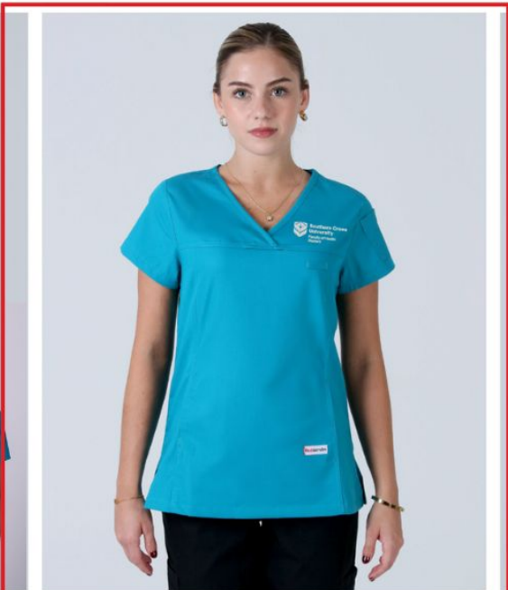
Southern Cross University Women's Fit Scrub Top (NURSING & MIDWIFERY ONLY)