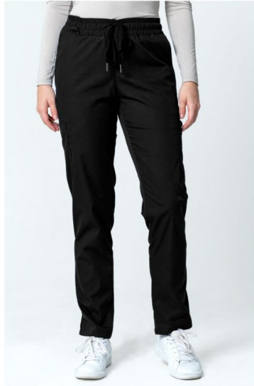
Southern Cross University Women's Slim Fit Cargo Pants $42.00