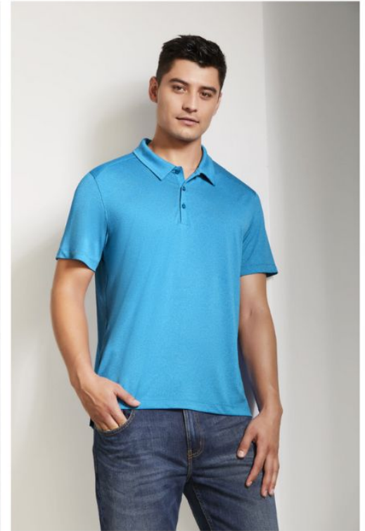
Southern Cross University Men's Polo Shirt $39.95