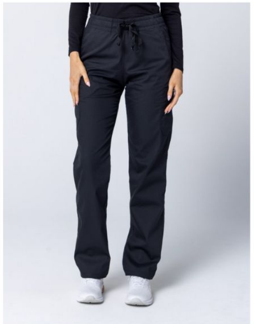
Southern Cross University Unisex Cargo Pants