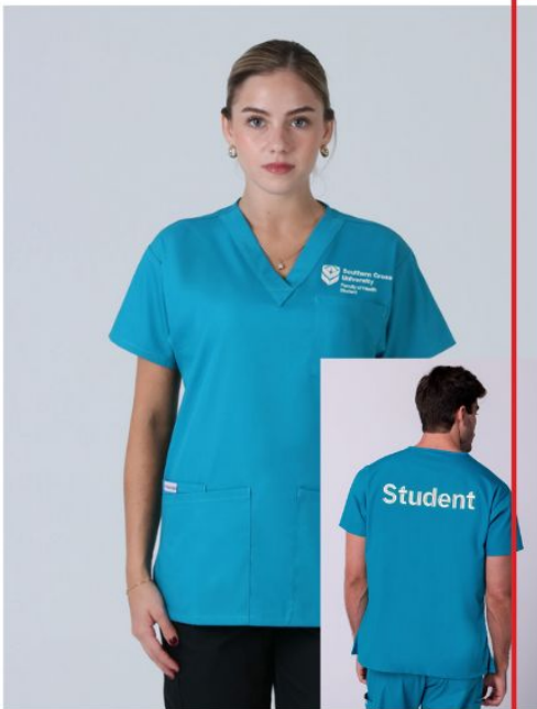
Southern Cross University Unisex 4 Pocket Scrub Top (NURSING & MIDWIFERY ONLY)