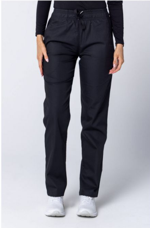
Southern Cross University Unisex Regular Pants $42.00