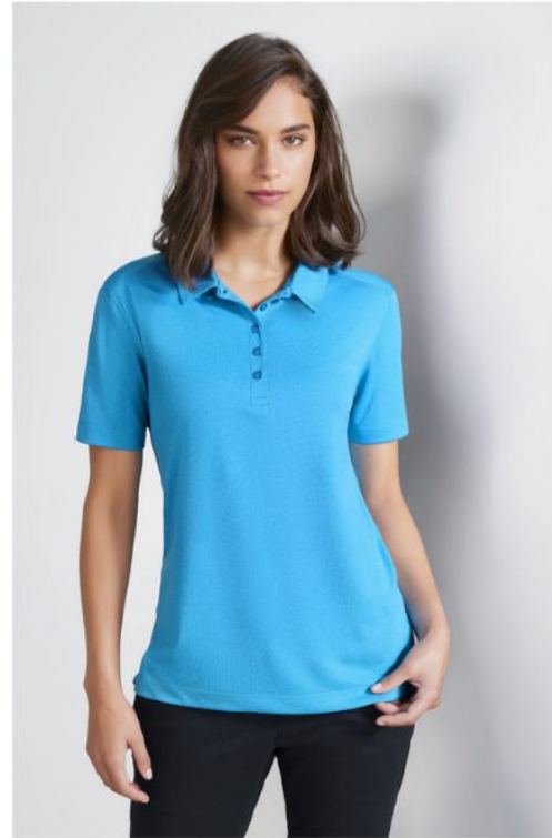
Southern Cross University Women's Polo Shirt $39.95