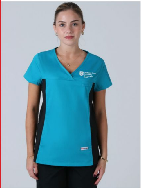
Southern Cross University Women's Fit Scrub Top with Spandex Panels (NURSING & MIDWIFERY ONLY)