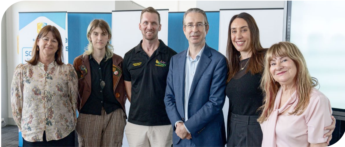
PSP 20th anniversary event at the Gold Coast campus