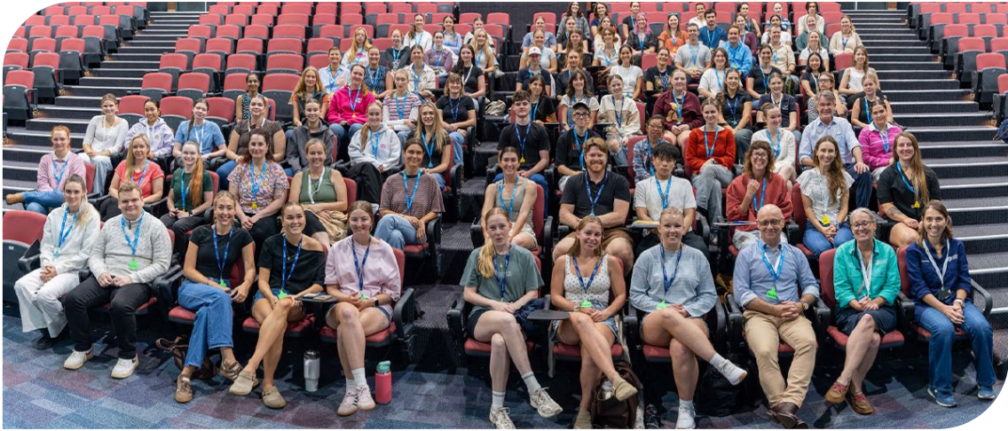
First cohort of Veterinary Medicine students at Northern Rivers campus