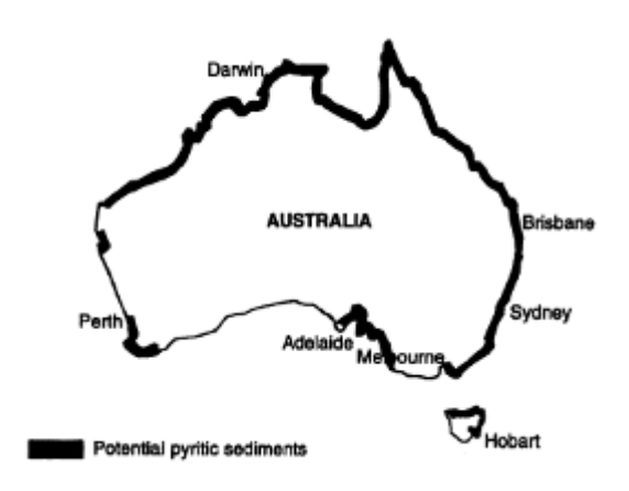
Figure 1 Indicative distribution of coastal acid sulfate soils in Australia

Coastal ASS occur in every Australian state and the Northern Territory. Using information on conditions necessary for the formation of ASS, together with the known geomorphology of the Australian coastline, it can be predicted that ASS should be found in coastal embayments and estuarine back swamps, with surface elevations less than about 10 m above mean sea level (10 m AHD). Extensive occurrences of ASS are found along the eastern and northern coastline of Australia with smaller areas in southern Western Australia, South Australia, Victoria and Tasmania (Figure 1).